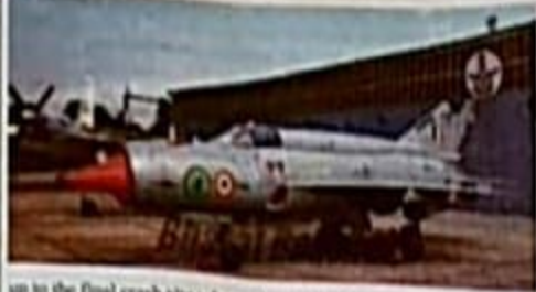
up to the final crash site where it went into flame.