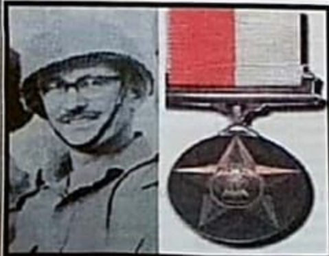
Lt Colonel Desmond Hayde MVC

Lahore from Indian hostile pushes. Great Trunk (GT) Road, connecting Amritsar and Lahore, cutcrosswise over Ichhogil canal close to Dograi. Dograi is one of the numerous open doors India has had since Independence to enter to capture Lahore. However each time, Indian Army needed to return.